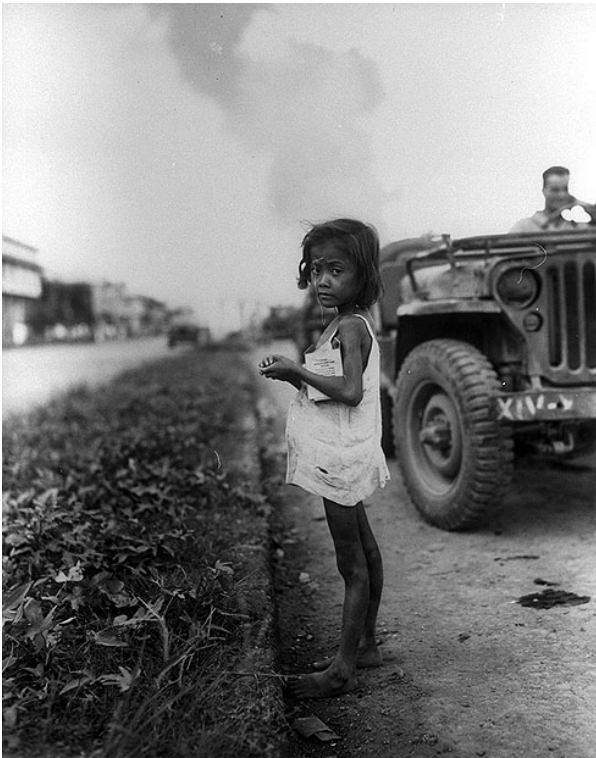
This is the cover girl for our video. We felt that this image told pretty much the whole story of the innocents.