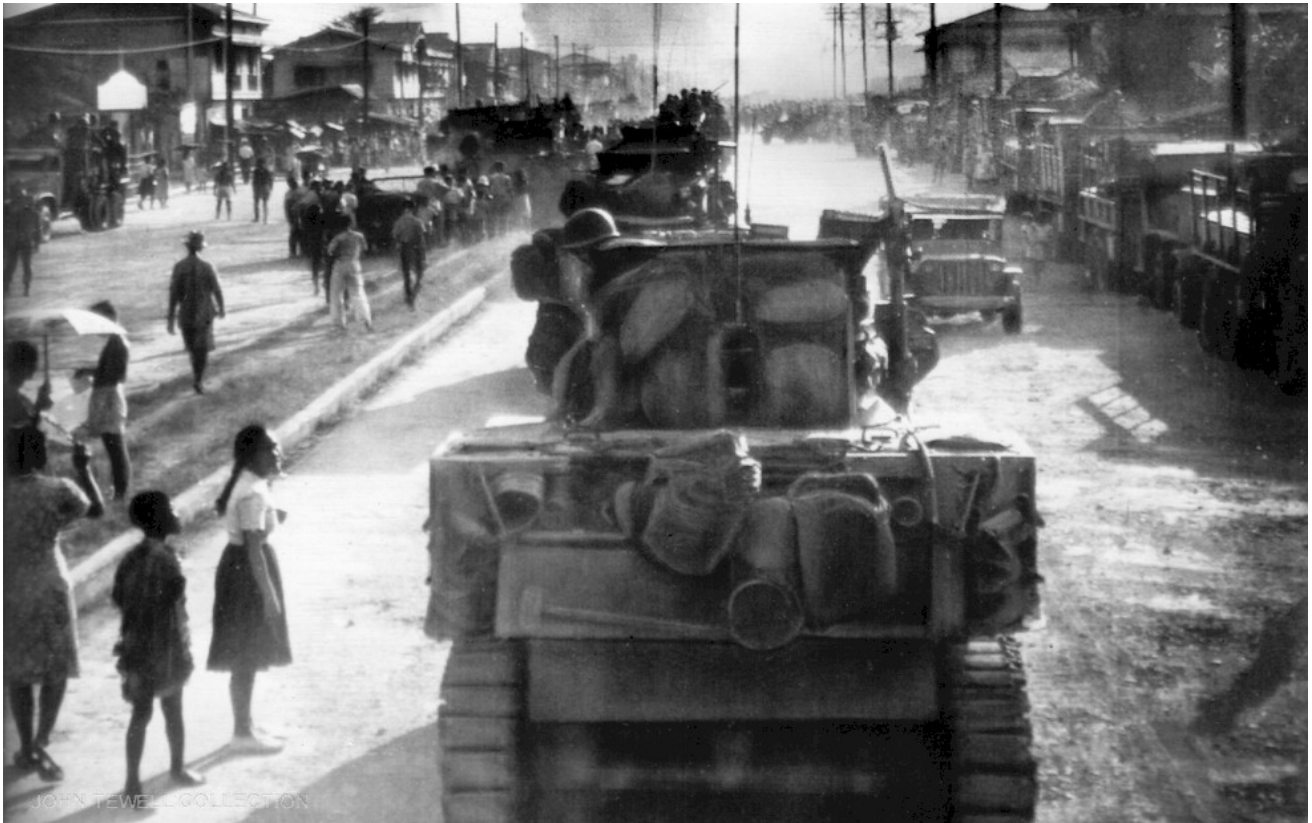
Battle over, steel helmets parked, people still dazed but the tension is over.

“By adopting the strategy of bottling up the adversary in an area with a resident population of one million, the Americans permitted the Japanese no alternative but a last ditch, scorched earth stand. That the Japanese behaved like the cornered rat of legend was to be expected.” [13] I have words to describe this observation that cannot be printed. Aluit’s own accounting of daily activity in the battle defies the logic of what he concludes. This amounts to one of the most unjustified and inaccurate statements ever made about the Battle of Manila.