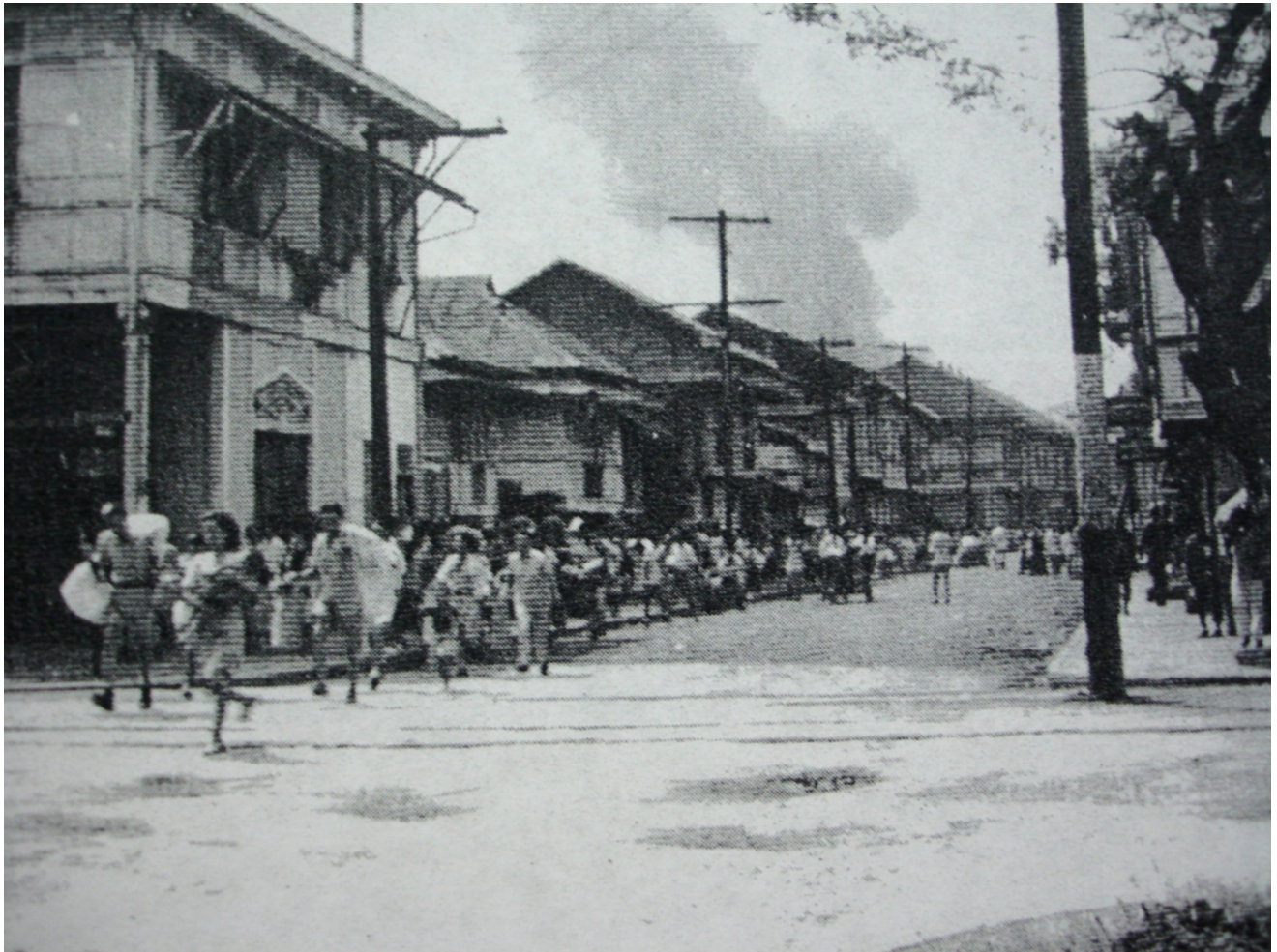
Filipinos learned to move fast – an art that saved many lives during the unpredictable events of the battle.

marriage certificate; this was also the only document wherein my mom's age was entered incorrectly (probably to make it seem like she was eighteen instead of her real age: 16).