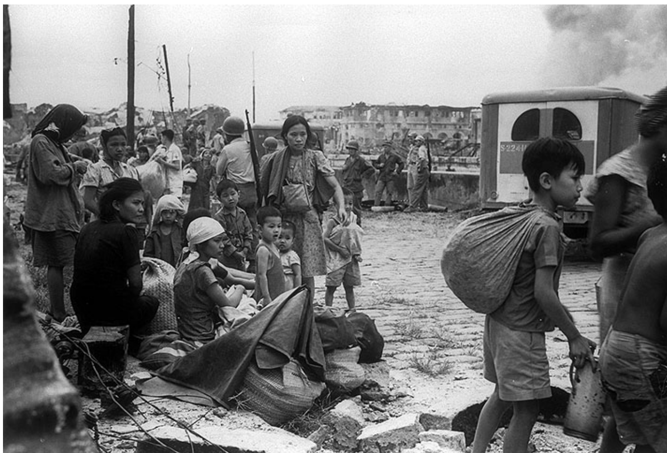
Filipino civilians like these were the intended targets of Japanese aggression. It was a deliberate use of atrocity as a tool of war.

----- © 2013 Peter Parsons - Ver: 130205 - 7,849 words-for Battle of Manila & Corregidor Historic Society