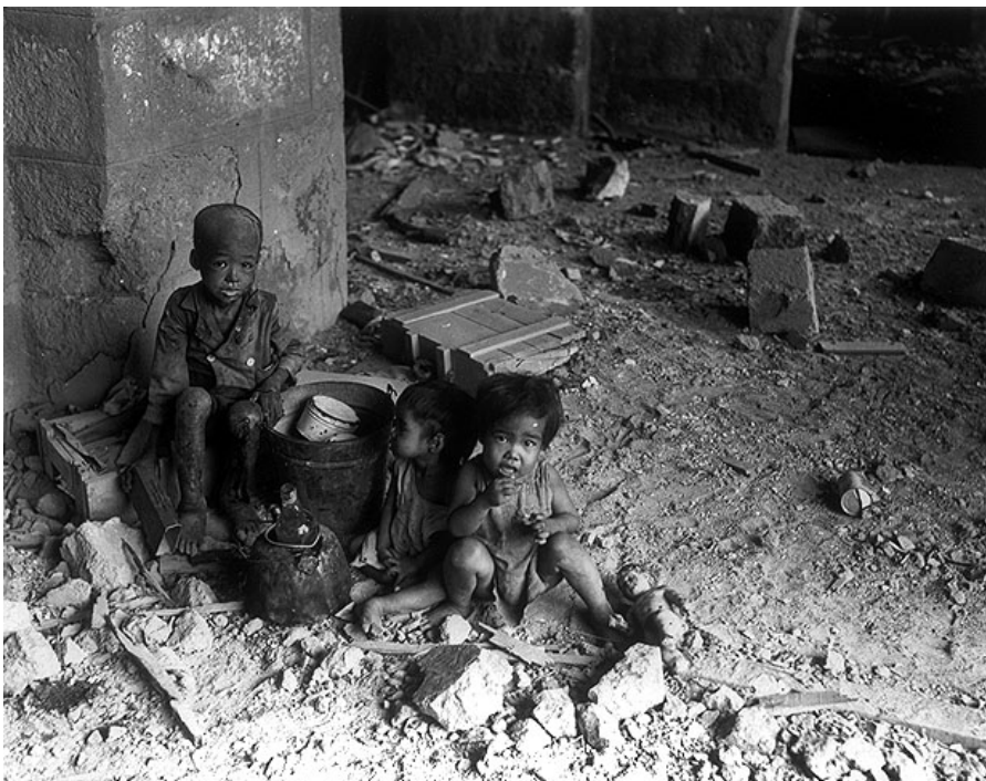
These kids are going to survive. Many did not.