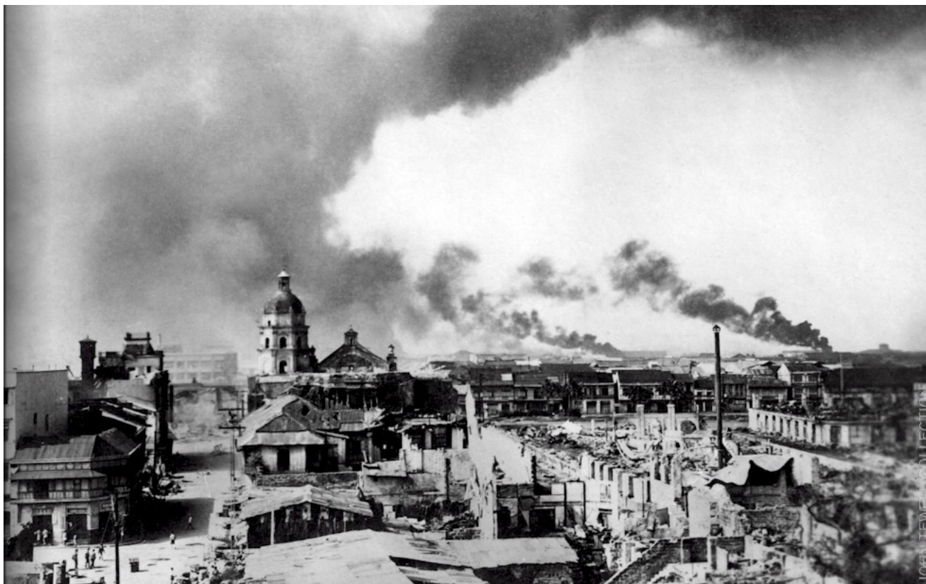
Part of what used to be called "The Pearl of the Orient."