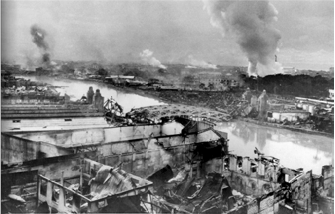
Another view of the former "Pearl of the Orient."

Does this sound like anyone is thinking "open city?"