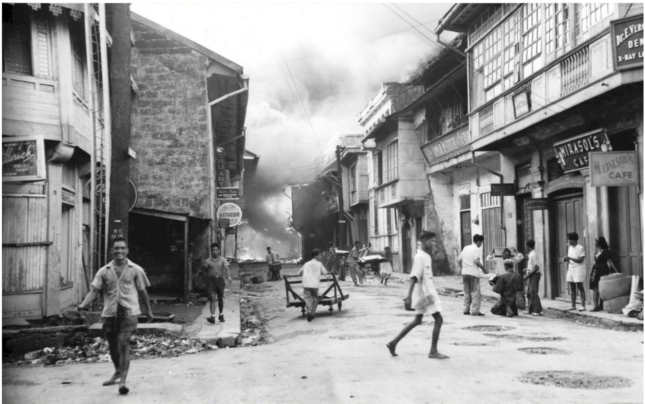
With a raging fire a block away, these people seem remarkably unconcerned.