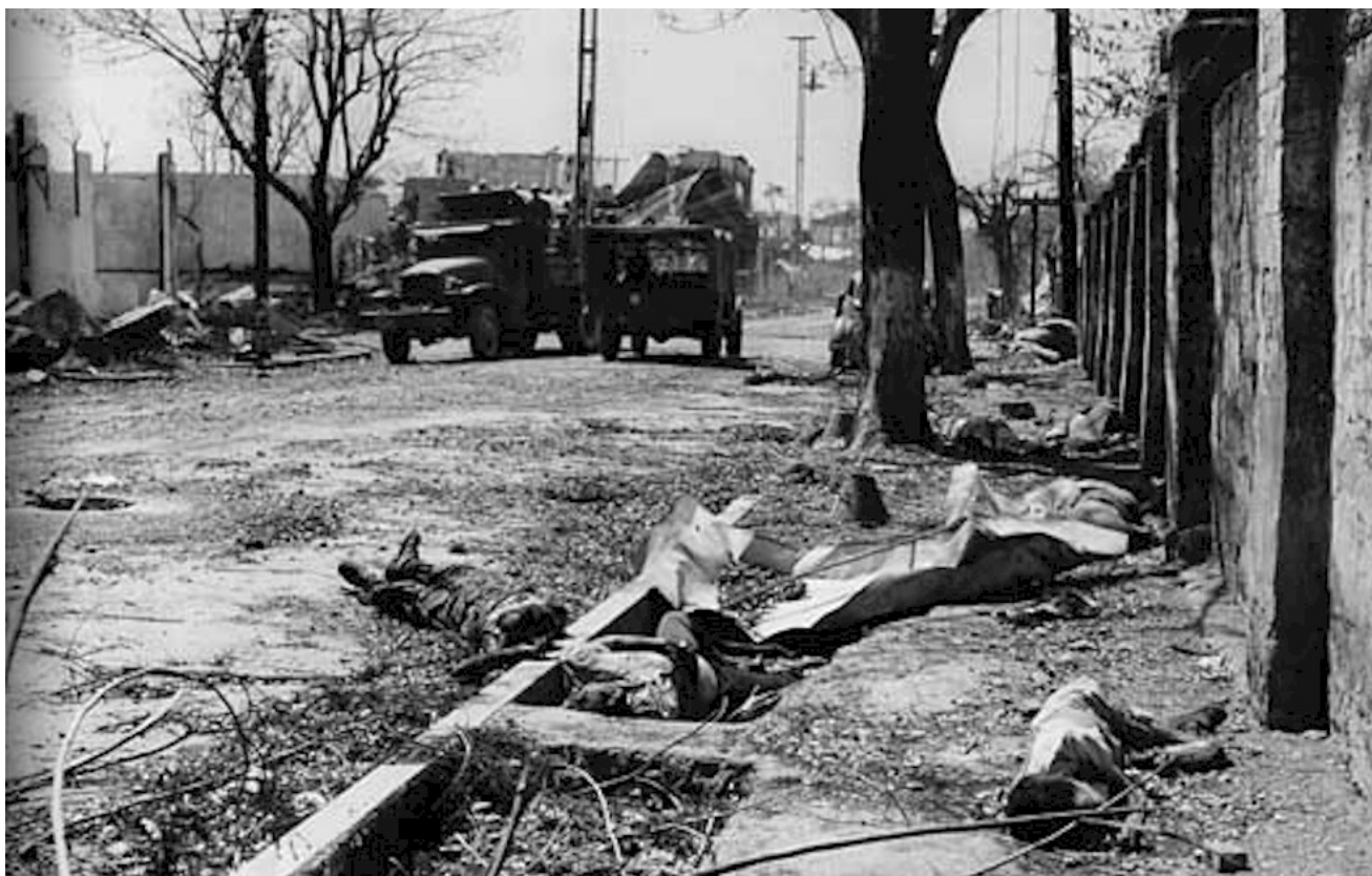
The Japanese would burn a home and kill those who fled the fire.

Yamashita never declared Manila an Open City, not when he was there and had the power and the authority to do so, and certainly not later when he was holed up in Baguio. The intent seems clear from the start to defend it to the last man and to kill off the civilians therein. Don't forget his leaving behind 4,000 of his own forces to defend north Manila. Nor that his reason for bringing the "puppet" government to Baguio was to save their lives! I think we should also remember that when these accused generals, like Yamashita, Homma, Yokoyama were testifying [my dad took us to several of the hearings at the US Embassy] they were not under any constraints to tell the truth before any Christian God; their purpose was to protect their own God, their Emperor. Better they should be found guilty of some US law than a man, a god, who we are finding of late was responsible for so much of the cruelty meted out by his troops throughout Southeast Asia, where they treated the captured and surrendered as "logs," and treated the civilians as worse. These generals